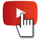
B-RAD SELECT video

B-RAD SELECT series torque wrenches offer high torque output and reliability combined with uncompromised cordless freedom.